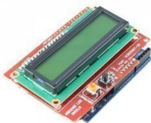
THIS IMAGE PRODUCT MAY BE DIFFER FROM IMAGE ABOVE.