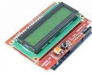
THIS IMAGE PRODUCT MAY BE DIFFER FROM IMAGE ABOVE.