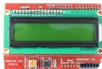
THIS IMAGE PRODUCT MAY BE DIFFER FROM IMAGE ABOVE.