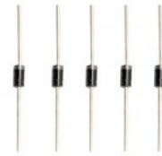
(Pack of 5)