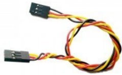
3 Pin Female To Female Jumper Wire